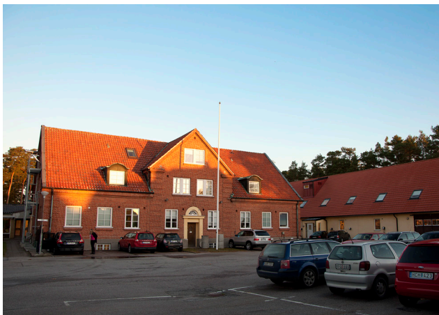
OPSIS LiquidLINE headquarters, Furulund,

With experiences from the process industry we know the difference between quality and quality!