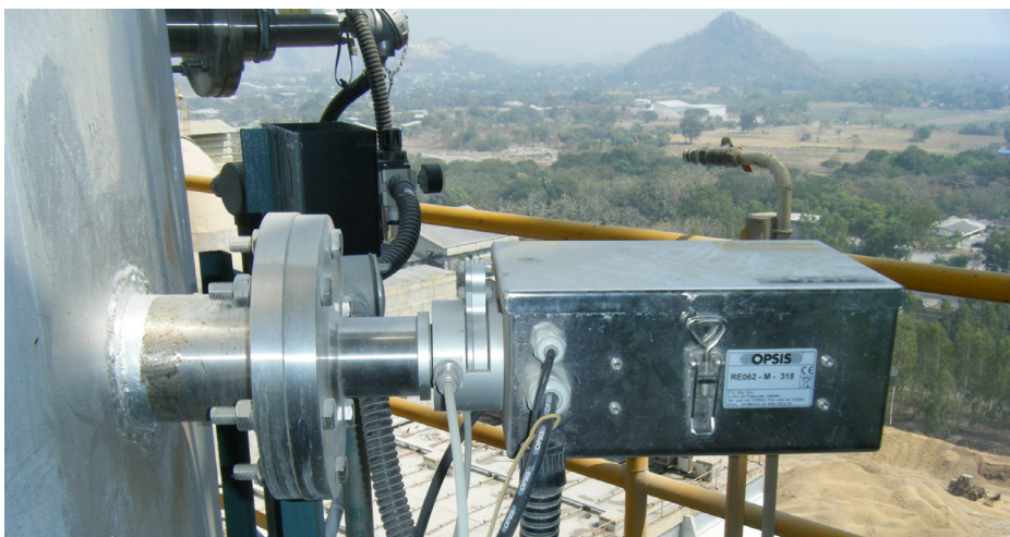
OPSIS' products are used in waste treatment plants to monitor stack emissions and for process control.