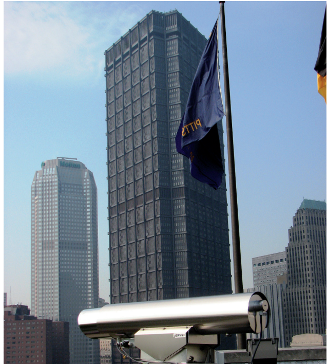
OPSIS' products are used to monitor city pollutions around the world.

Opsis is an international company represented on all continents. A network of distributors has been established for sales of our gas solutions. Today, more than 90% of the company's sales go to markets outside of Sweden.