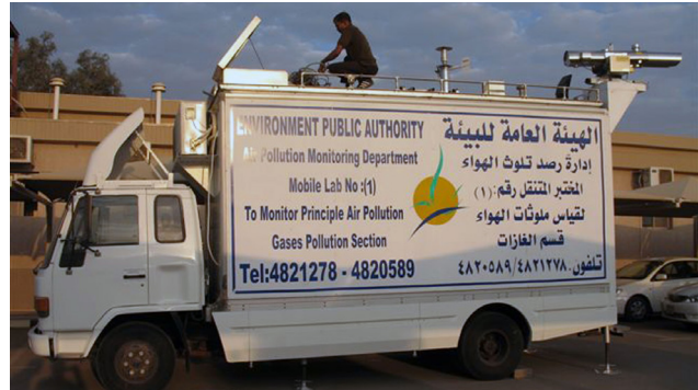
An OPSIS installation in Middle East

Quality procedures are always at the heart of our business, whether it is regarding maintenance of our instruments, tracking of main components used or customer support - the customer needs are always in focus and something we stress in all our trainings.